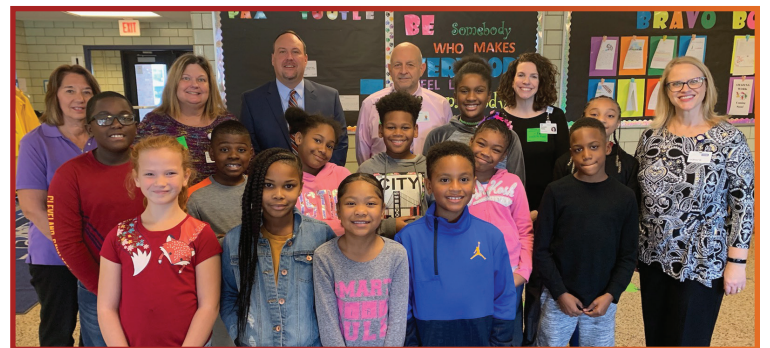
The Helping Hands Committee from Marymount Hospital, the Garfield Heights Kiwanis and the Cuyahoga County Board of Health assembled donated items to create Hygiene Closets at each building in the District.