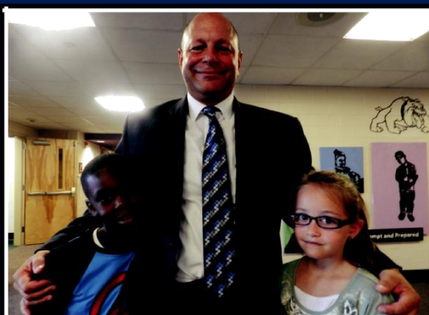
William Foster Elementary School

Additionally, the Garfield Heights City Schools made another significant investment in technological resources over the summer months. The district upgraded its internal network so that each and every one of the district's buildings are wired to be up to ten times faster in terms of its Internet speed, an upgrade of substantial proportion. Additionally, the district is moving toward utilizing more online textbooks, especially in the areas of reading and math. Mobile technology has been of specific importance throughout the district, where B.Y.O.D., or Bring Your Own Device best-practices will soon be shared with parents and will be strongly promoted to all students. Best of all, the district is partnered with eRate, a federal program with certain requirements, which permits the schools to be reimbursed up to 80% of its costs for various technologies being returned to the district. At this point in time, all K-1st Grade classrooms have at least 5 iPads in each room, and each 2nd, 3rd, 4th and 5th grade classrooms have at least 7 chrome books per room. Technology has been, and will continue to be, a top priority for the Garfield