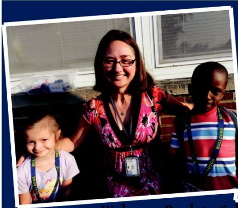
Welcome Back to School!