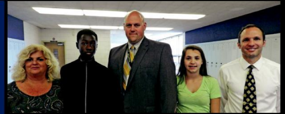
The Incoming Leadership Team at Garfield Heights

Combined, the newest additions to the Middle School administrative team will help to bolster the educational experience and positive behavior support initiatives taking place throughout the building. The Garfield Heights City Schools welcomes these individuals to their respective roles.